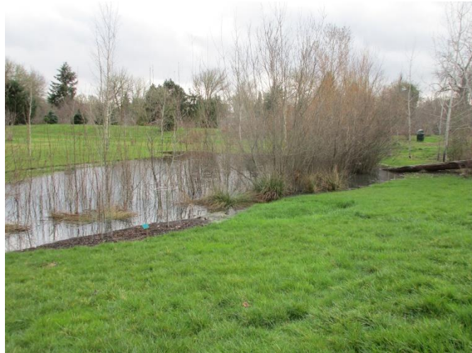
Our Seasonal Wetland

Our seasonal wetland was excavated in 2003, as a part of the project to slope the creek bank and install engineered logjams. After soil tests showed that the underlying clay layers would hold water, engineers from the Oregon National Guard used their bulldozers to excavate the wetland. Our intent was to mimic the seasonal wetlands which dotted the Willamette Valley prior to European settlement. The wetland is fed by rain runoff and possibly seeps or springs in the sloping land to the northwest. An overflow drainage swale was carved out, from the south end of the wetland southeasterly about 300 feet across the meadow. From that point (near the Conifer Informational Sign) the water enters a pipe under the Creek Trail and then downslope, overland into Rickreall Creek.